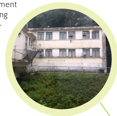
教職員宿舍 G 座舊貌

The first project of the College development plan is to demolish Staff Quarters Block D & G and re-build a “twin tower” on the hillside of Chung Chi campus. Thus, adapting well to the landscape of the College, “Chung Chi Student Development Complex”, which is composed of the Student Development Centre (Low Block) and Multi-functional Building (High Block) that connecting by a double-deck bridge, is expected to offer students with maximized interior activity space and an astonishing shortcut between Chung Chi and the University Central Campus.