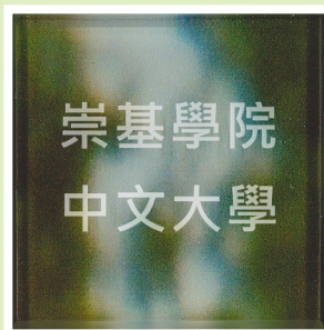
馬賽克瓦片樣本 Mosaic tile samples (60mm × 60mm)

這約2萬塊瓦片將會併砌出宏偉的崇基牌樓圖案，展現𧯛力量，寓意众志成城，齊心合力成就「崇基學生發展綜合大樓」，支援崇基同學實現夢想！